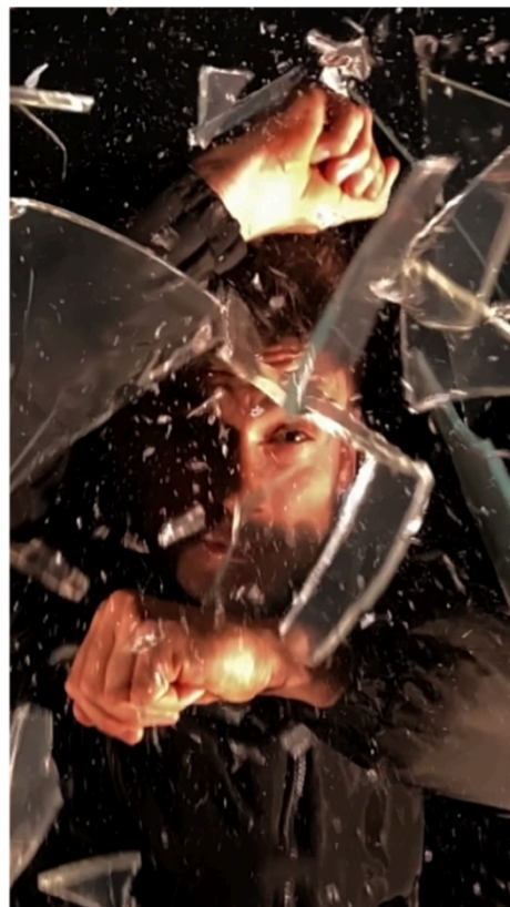
Jeff Koons, One Ball Total Equilibrium Tank (1985), Mark Leckey, To the Old World (Thank You for the Use of Your Body) (2021-22).