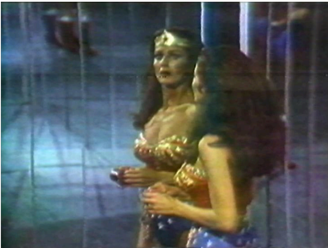
Dara Birnbaum, Technology/Transformation: Wonder Woman (1978-79)